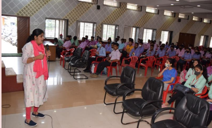
Workshop on 21st Century Skills for Bright Future (12/03/2022)