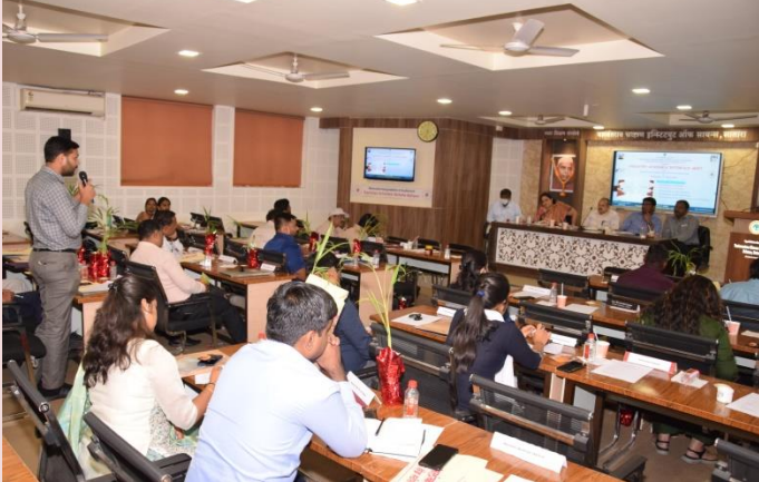
Industry-Academia Interface Meet –Life Sciences (16/03/2022)