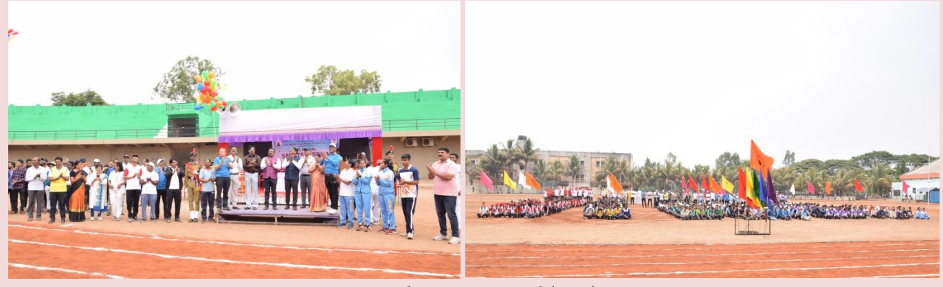
Annual Sports Festival (2022)